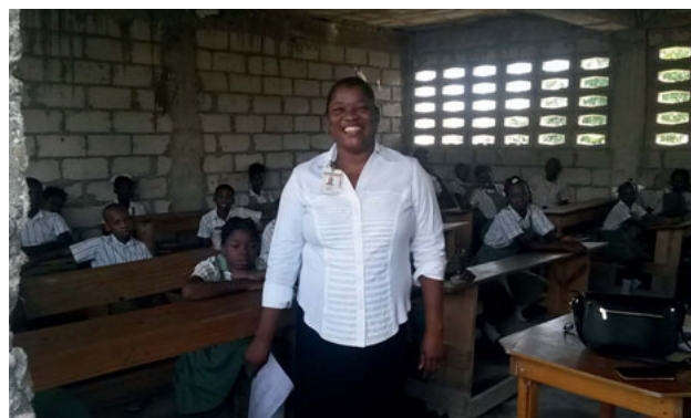
Test administration in a school in the Artibonite Department (district), Haiti

With decades of experience in the successful administration of international large-scale educational assessments, the IEA was able to offer valuable insight and provide advice on quality control measures for test administration and data collection.