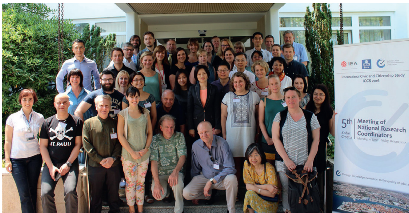
ICCS 2016 NRCS AND TEAMS REVIEWED THE DRAFT INTERNATIONAL REPORT IN JUNE IN ZADAR, CROATIA.

LinkedIn or Twitter channels to keep abreast of the full program of activities.