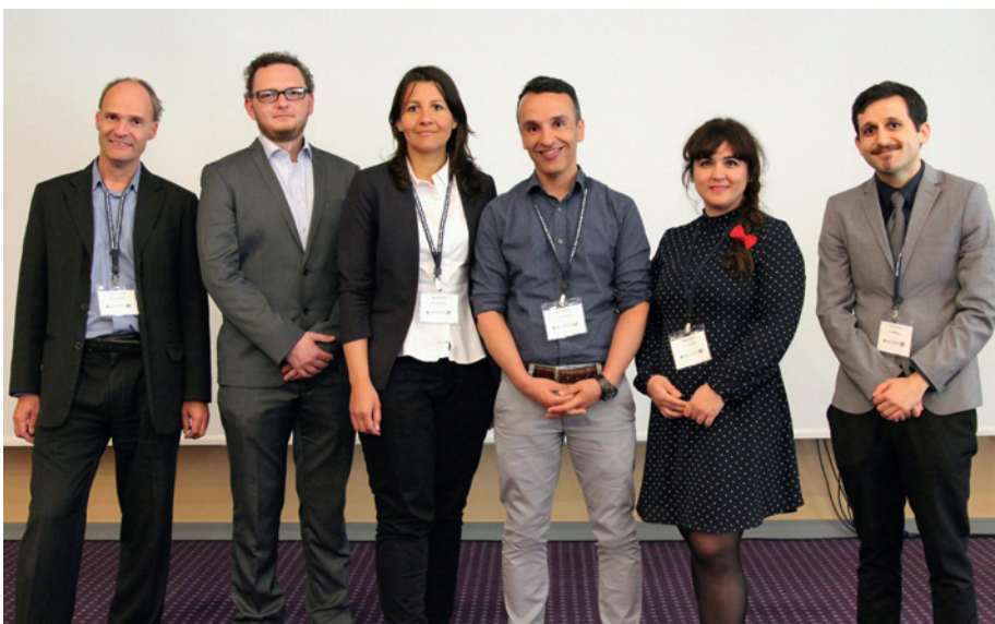
STAFF FROM IEA HAMBURG AND STATISTICS CANADA CONDUCTED PIRLS INTERNATIONAL DATABASE TRAINING IN LATVIA IN JUNE 2017.

The two IEA studies (the eTIMSS Pilot and ICILS Field Trial) were administered