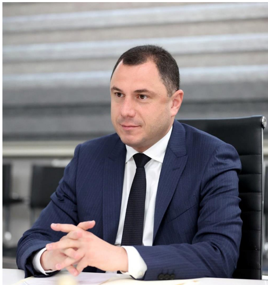
Giorgi Amilakhvari Minister of Education and Science of Georgia

We look forward to hosting you in Georgia and sharing our culture, diverse landscape, and unique wine-making practice and local cuisine. I personally extend a very warm welcome to each and every one of you.